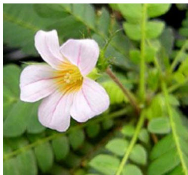
Flower of Biophytum sensitivum

It is a small plant, rarely exceeds 2.5-20 cm in height and form an unbranched woody erect stem. All leaves grow on the top of the stem. Leaves are abruptly pinnate, sensitive, 3.8-12.7 cm long and are made of 8-17 pairs of leaflets. Leaflets are opposite, 1 cm long, terminal pairs the largest and pairs becoming smaller downwards. Flowers are dimorphic, 8 mm across, yellow and crowded at apices of the peducles. The sepals are lanceolate, 7 mm long with parallel nerves. Corolla is much exceeding the sepals. Lobes are rounded and spreading. Style is nearly glabrous. Fruits are ellipsoid capsule. Seeds are prominently ridges and transversely striated. The plant has been observed flowering and fruiting in the month of September to December (CSIR, 2004; Pullaiah, 2006).