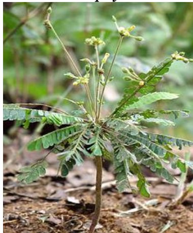
Whole plant of Biophytum sensitivum